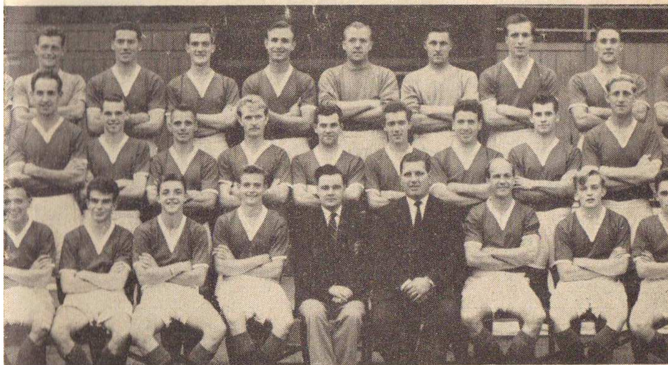
Our final picture in the team series is of Swindon Town, Rangers' opposition in tonight's concluding game of the season.

Monday, 27th April, 1959 K.O. 7.30 p.m. League, Div. III SWINDON TOWN